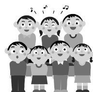
BEE Primary Choir!